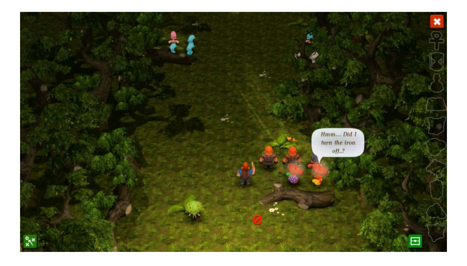
Download ->>->> <a href="http://bit.ly/2JmTxwX">http://bit.ly/2JmTxwX</a>